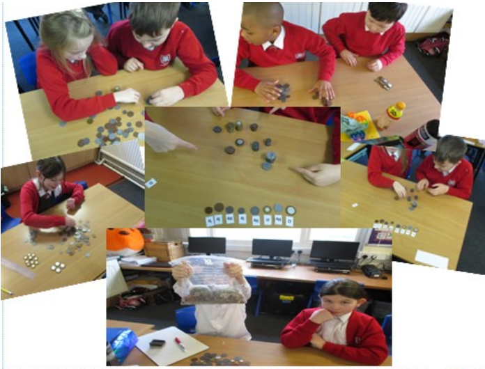
The children explored money. They were able to recognise the denominations, sort coins into different groups and then order them from the smallest value to the greatest. The children looked at counting in 1p, 2p, 5p and 10p and made links to counting in greater monetary values. We explored how many 1ps made 10p and £1, then made predictions on how many pennies made £10. The children after visually seeing and feeling the weight of £10 in pennies reasoned why and what else could be used to represent £10.

We have been very light on the ground this week, so the classroom has felt very empty but we have had great fun learning. I have missed all the children at home, however, I have loved seeing all the work they have sent me following what we are doing in class. So thank you parents and children at home for maintaining their education so they are ready for next week.