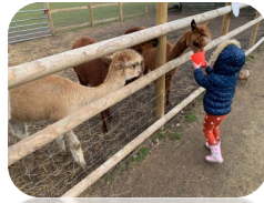
Isla uploaded a picture of her feeding the llamas. How brave!