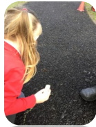
Nursery were using chalk on the yard drawing pictures and mark making.