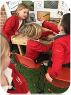
The children were playing schools together!

Next week we will be reading How to Catch a Star by Oliver Jeffers, looking at shadows and finding out about the moon. I wonder if the children have ever spotted the moon in the morning?!!