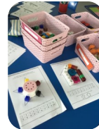
This capacity challenge did not stump our children!